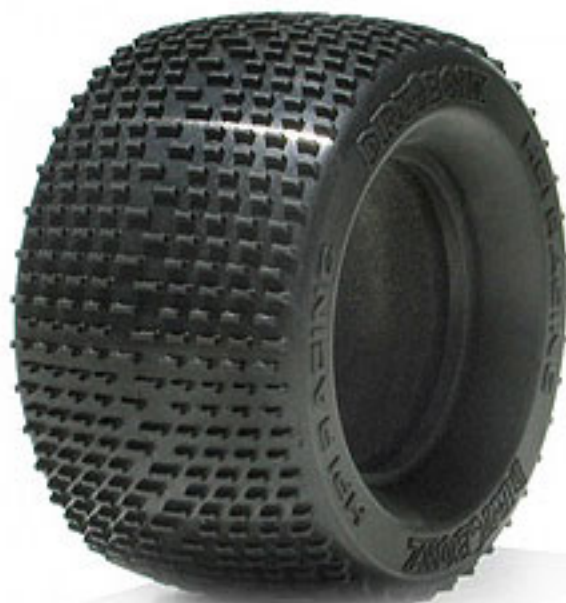
Dirt Bonz Tyre S Compound (#4852)

And the legendary Savage "Proven Tough" parts are standard equipment: Aluminium alloy TVP chassis plates, tough reinforced nylon suspension arms, front and rear impact bumpers, alloy roll hoop, 8 long stroke oil-filled shocks, stainless steel hinge pins, and full-time four wheel drive make the Savage one of the toughest Monster Trucks ever. Power comes from the proven S-25 engine that features a billet aluminium heat sink head for extra cooling, dual bushing aluminium connecting rod, true ABC chrome sleeve construction for long engine life, a composite body for better performance at higher temperatures, and a simplified dual needle 7mm slide carburettor for easier tuning. The electronic Roto Start engine starting system is included, making starting the engine as simple as pressing a button. The combination of the S-25 engine, 3-speed tranny and tuned pipe give this Limited Edition truck plenty of power for hours and hours exciting off-road driving.