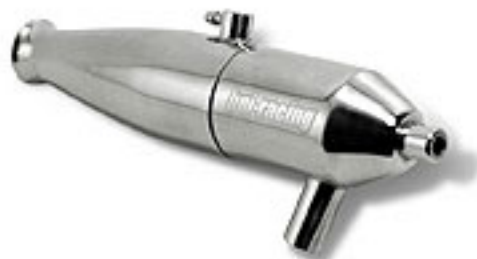
Aluminium Tuned Pipe (Polished) (#86138)

To help stop the truck from high speeds, dual stainless steel drilled disc brakes are standard equipment. With twice the surface area of the stock brakes, the dual discs give the truck the ability to stop time after time with no brake fade. And, peak braking is now high enough to do stunts like "brakies" on command. The cross-drilled stainless rotors are also more durable and provide improved braking in extreme driving conditions like mud, sand and water.