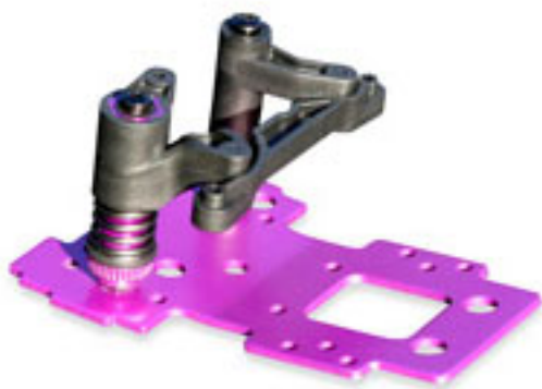
Cam Type Servo Saver (#87197)