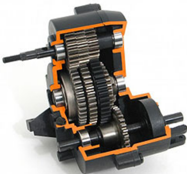
3 Speed Transmission For Savage (#87218)

To make the Savage Limited Edition look great we added shiny chrome 6 spoke wheels and a special metallic blue/silver/graphite paint job for the GT-1 body. Standard rubber is our grippy Dirt Bonz tyres that not only look great, but also give the truck incredible handling and performance for off-road driving. At nearly 40% lighter than the stock tyres, the Dirt Bonz deliver quicker acceleration, more grip and faster lap times on the race track. All of the latest Savage upgrades are pre-installed: Cam-type servo saver for more accurate and responsive steering, 4-gear diffs for extra durability, improved throttle and brake linkage, rear tie-rod washers, 3 shoe clutch for quick acceleration, and our new high performance air filter to help protect the engine from dirt and dust.