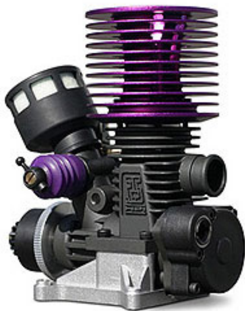
Nitro Star S-25 Engine

To help stop the truck from high speeds, dual stainless steel drilled disc brakes are standard equipment. With twice the surface area of the stock brakes, the dual discs give the truck the ability to stop time after time with no brake fade. And, peak braking is now high enough to do stunts like "brakies" on command. The cross-drilled stainless rotors are also more durable and provide improved braking in extreme driving conditions like mud, sand and water.