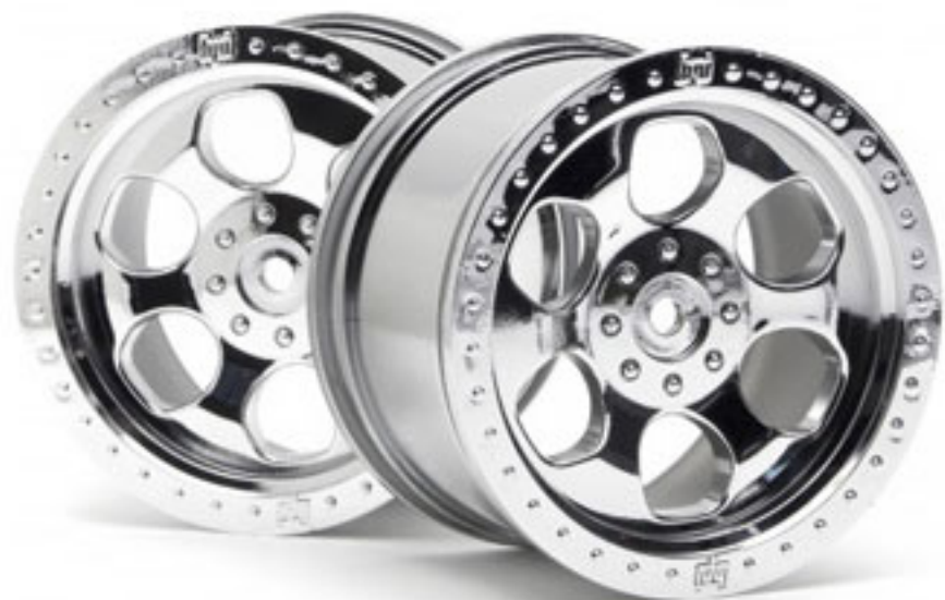
6 Spoke Shiny Chrome Wheel (#3117)