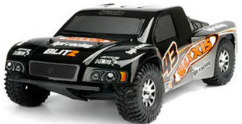
103741 RTR BLITZ WITH MAXXIS ATK-10 BODY (BLACK)