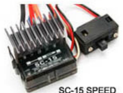
SC-15 SPEED CONTROLLER