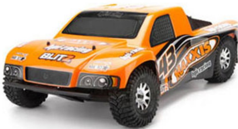
103173 RTR BLITZ WITH MAXXIS ATK-10 BODY (ORANGE)

RTR, 1:10 SCALE, ELECTRIC, 2WD SHORT-COURSE TRUCK